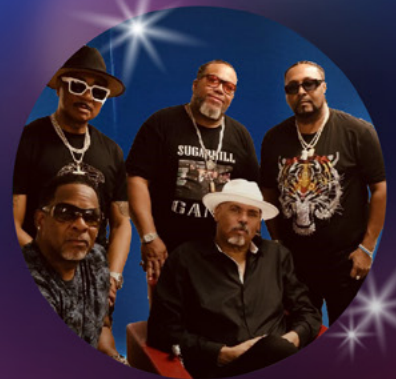
THE SUGARHILL GANG