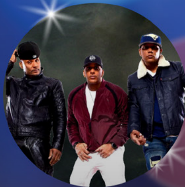
THE FUNKY BUNCH